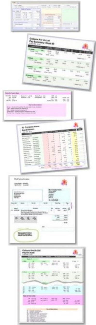
ABC6 reports printed on a cheap inkjet are colourful and easy to read, and very very fast.

Our first attempts at a Windows version of ABC had us trying to